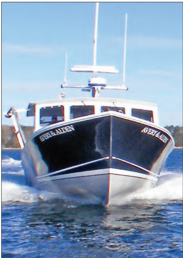
Avery & Alden at speed.