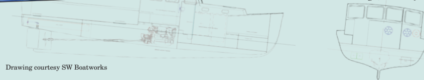
Drawing courtesy SW Boatworks