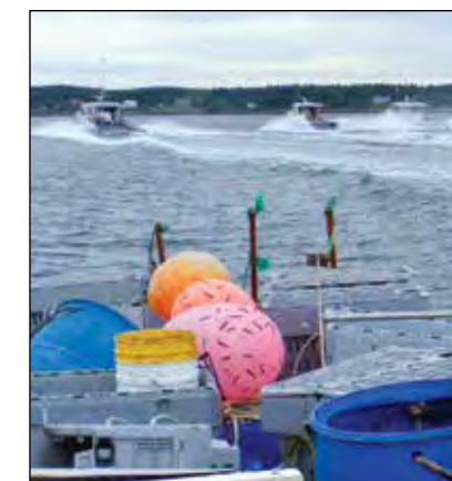
The view from the best seat in the house.

Safety and integrity are our Maine concerns