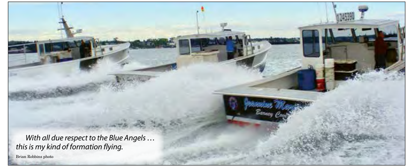
With all due respect to the Blue Angels ... this is my kind of formation flying.

I ain't gonna lie: it was wicked cool. ■